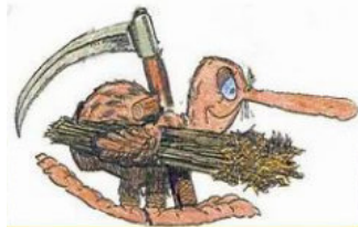
Aotearoa1 (NZ Industrial Hemp Cultivar)™